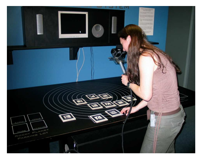
Figure 3: The S.O.L.A.R System in use. See Figure 1 for a view of what the user would see through the handheld visor.

The website also provides a condensed version of the BlackMagic Kiosk that can be downloaded and run at home. Once the software is installed, the user simply prints out the black markers and views them through a standard web camera.