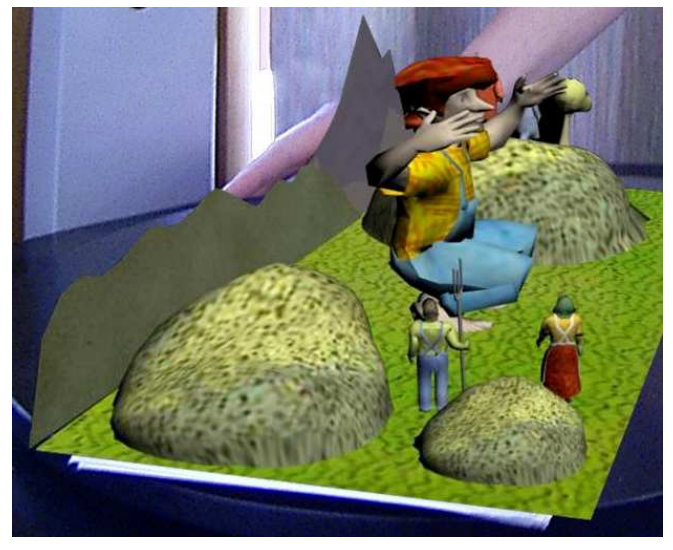
Figure 7: The 'Giant Jimmy Jones' eyeMagic storybook.

As the book is still be able to be read as a traditional story