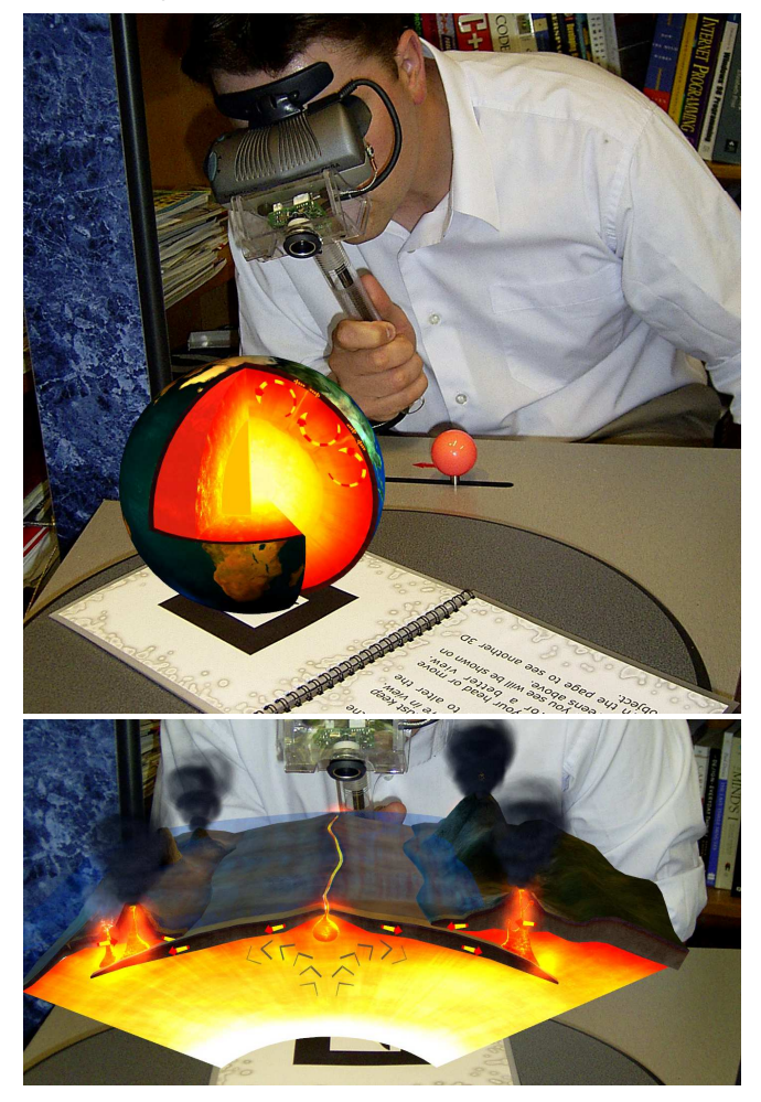
Figure 5: Top: The AR Volcano Kiosk in use. Note how the slider is being used to highlight the convection currents. Bottom: A page showing the use of dynamically-lit particle systems and pixel shaders for lava and water. The slider moves the tectonic plates.

The interactive slider allows the user to control some aspect of the content on each page. As you move the slider up, the animation advances, and as you move it down, it rewinds. Interactions include volcano formation, movement of tectonic plates, the sequence of events in the eruption of Mount St Helens, flows of magma in convection currents and the resultant forces