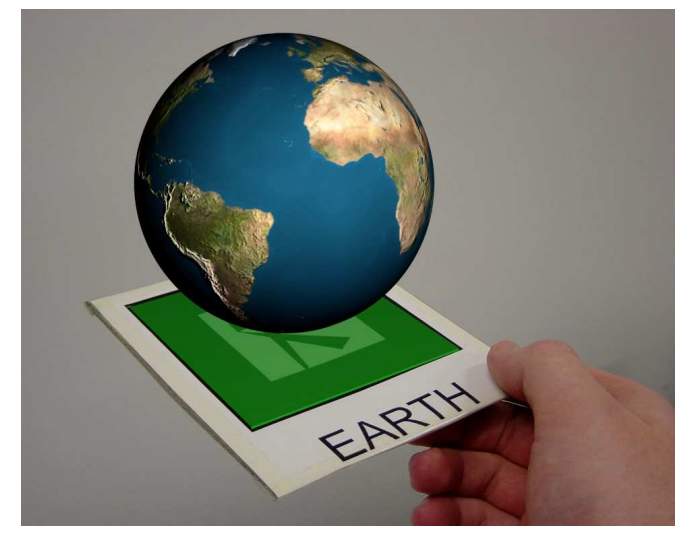
Figure 1: Example of Augmented Reality - a virtual planet 'anchored' on a real square (marker) as seen in the S.O.L.A.R System exhibit (Figure 3).

Barbara Garrie mark.billinghurst@hitlabnz.org_graham.aldridge@hitlabnz.org_bag23@student.canterbury.ac.nz Claudia Nelles claudia.nelles@hitlabnz.org