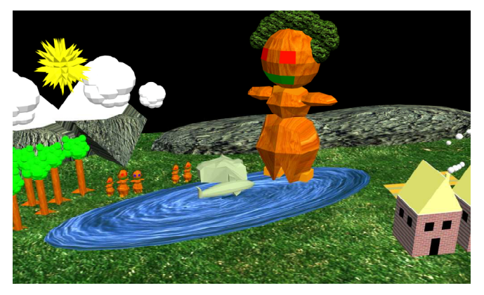
Figure 8: Work produced in the workshop for 10 to 14 year old children. Based on the 'Giant Jimmy Jones' storybook.

The second stage to this project involved creating a workshop for 10 to 14 year old children in which they could create their own virtual story book (Figure 8). Ten children were given a week in which to learn a combination of basic 3D modelling techniques and an awareness of narration and storytelling. During the week the ten children were grouped into pairs, and each pair worked on creating their own page of the 'Giant Jimmy Jones' story. It was found that children of this age were able to learn rapidly and produce results that were entertaining and highly creative. Research into the educational benefits of this workshop has just been completed [McKENZIE AND DARNELL 2003].