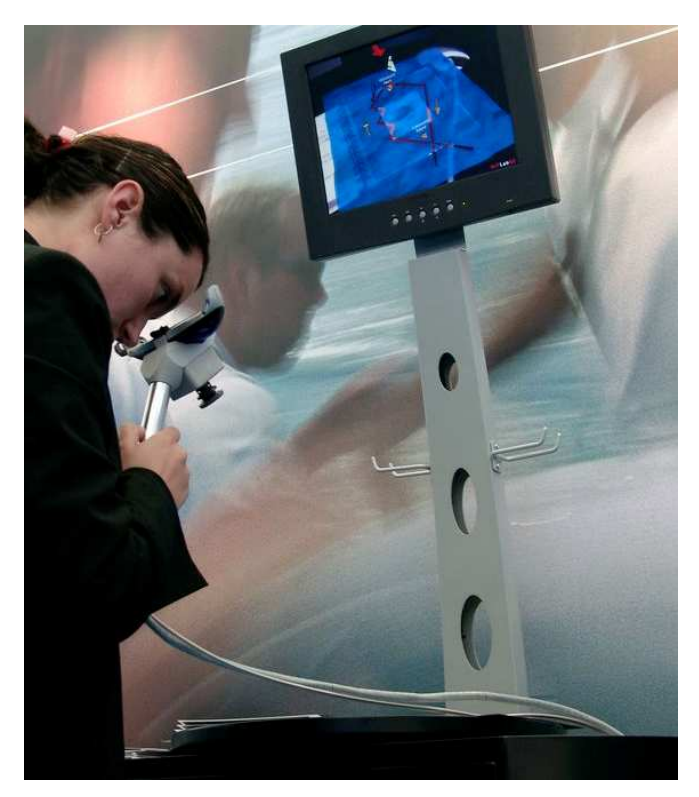
Figure 2: The BlackMagic Kiosk depicting the history of the America's cup in Augmented Reality.