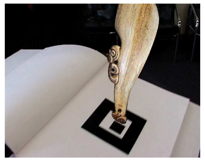
Figure 6: A digital replica of a Maori whalebone club in AR

A prototype has been developed which currently consists of a virtual Maori whalebone patu (club) (Figure 6) and a human face being presented in a Magic Book. Both objects are replicas of real world objects - a technique made possible by the FastScan system, developed by a Christchurch company [ARANZ 2004]. FastScan is a handheld laser scanner that can be swept over the surface of a real object to digitize it into its virtual replica. This